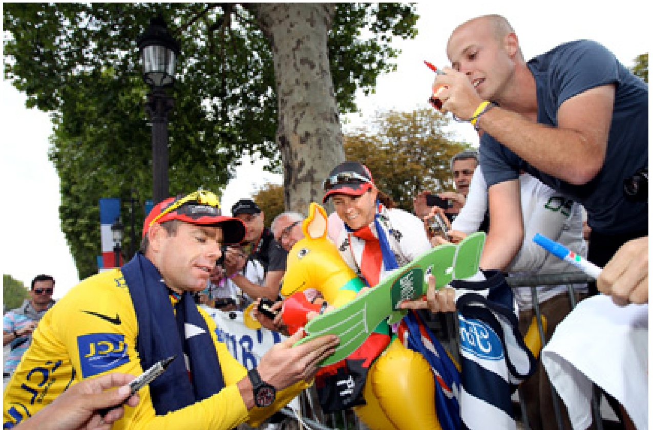
Foix / Toulouse Hotel: 81 km (50 miles) – 45 min